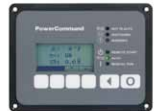
Optional operator/display panel