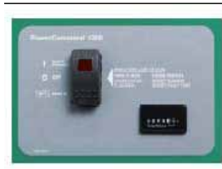
Standard operator panel