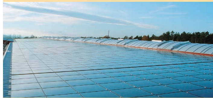
340 kW, German factory rooftop

Single-layer glass with polymeric backskin lowers pounds per watt and transportation costs. Modules are sized to optimize the greatest amount of power, easily handled by one person.