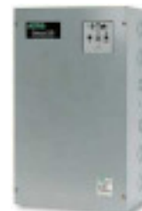
Optional Automatic Transfer Switch