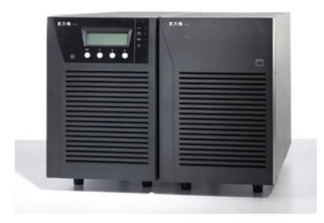
Add up to four EBMs for hours of runtime