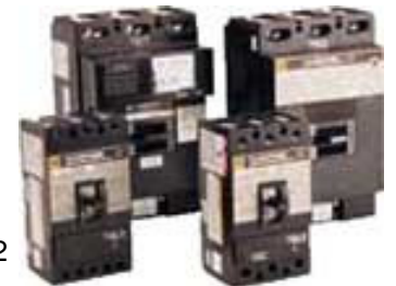
Square-D Line of Circuit Breakers, including Ground Fault Protection